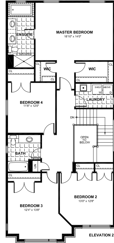
SECOND FLOOR PLAN W/ OPTIONAL 4 PC ENSUITE